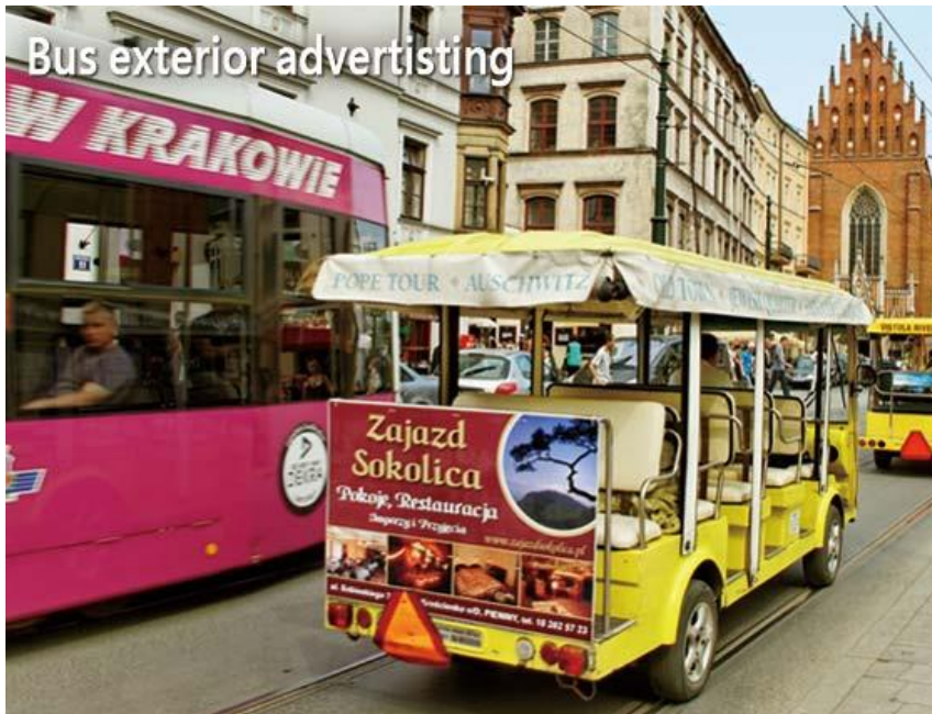
Bus exterior advertising